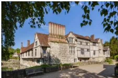
National Trust – Ightham Mote

As one lives further into retirement 'weekend' no longer has the same effect as during one's working life.