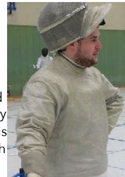
Growing pains: Mole to Epee Man

After an eventful year in Germany, and a few encounters with his old club at various