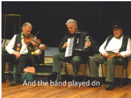
And the band played on

It was so much fun, whether you were taking part or - like me - just watching. And so energetic, even for the watchers.