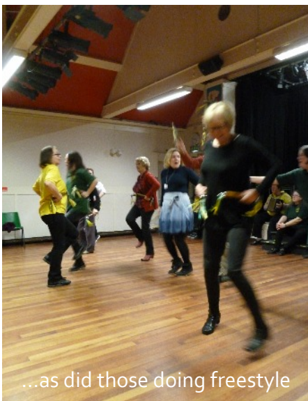
...as did those doing freestyle