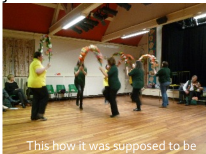
This how it was supposed to be

How wrong I was for it was an absolutely splendid evening. The dances were performed with great gusto and expertise, although the latter quality may have been lost to some extent when a few of the Players - the braver ones - joined in.