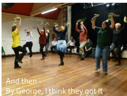
And then - By George, I think they got it.