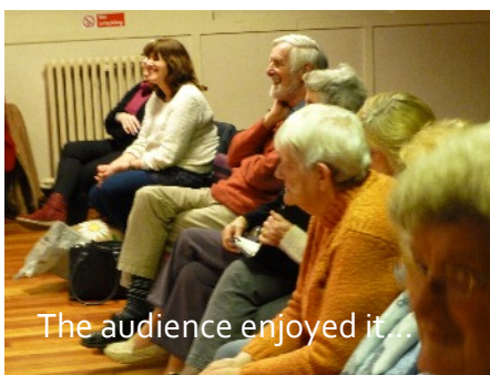
The audience enjoyed it...