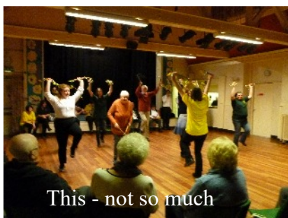
This - not so much