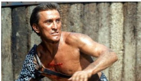
He became a Centenarian in December, but how would he have fared as Issur Danielovitch Demsky instead of his assumed name of Kirk Douglas?

real name of Margarita Carmen Cansino? And how about Frances Gumm (Judy Garland); Frederick Austerlitz (Fred Astaire); Archibald Alexander Leach (Cary Grant) and Lucille LeSueur (Joan Crawford)?