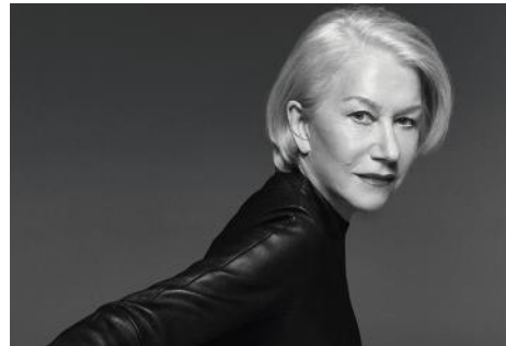
Helen Mirren but her birth certificate said Ilyena Lydia Vasiliievna Mironov

son, Edda Kathleen van Heemstra Hepburn-Ruston became Audrey Hepburn; Allen Konigsberg became Woody Allen and Ramon Antonio Gerard Estevez became Martin Sheen.