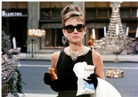
Edda Kathleen van Heemstra Hepburn-Ruston or Audrey Hepburn, you choose?

real name of Margarita Carmen Cansino? And how about Frances Gumm (Judy Garland); Frederick Austerlitz (Fred Astaire); Archibald Alexander Leach (Cary Grant) and Lucille LeSueur (Joan Crawford)?