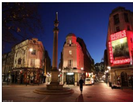
The Seven Dials, Covent Garden

Of course as we progressed around the route we kept meeting the "Opposition" and immediately everyone began pointing and looking in every direction hoping to put each other off the scent. The competitive spirit rising to the fore!!!