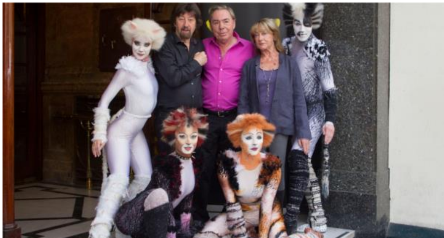
CATS cast with Trevor Nunn, Andrew Lloyd Webber & Gillian Lynne

Oh' what was the show, well our visitors were a Mr Webber and a Mr Nunn who were working on something called "Cats". I believe it did rather well!